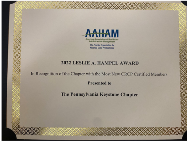
2022 Leslie A. Hampel Award In Recognition of the Chapter with the Most New CRCP Certified Members